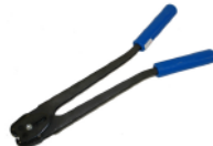
Sealers & Cutters